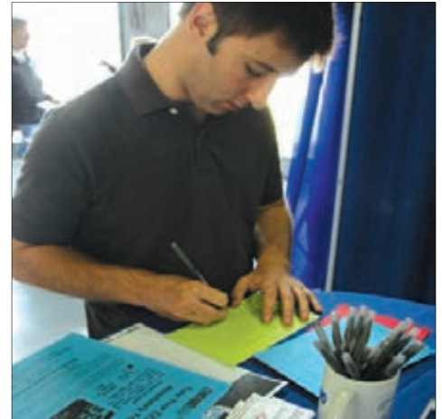
A High School Student signs up for information at ACE.