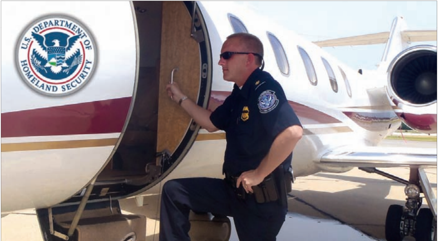
Chicago Executive Airport customs officer meets an arriving aircraft. The customs office at CEA was kept busier than usual in June when they handled a record number of flights.