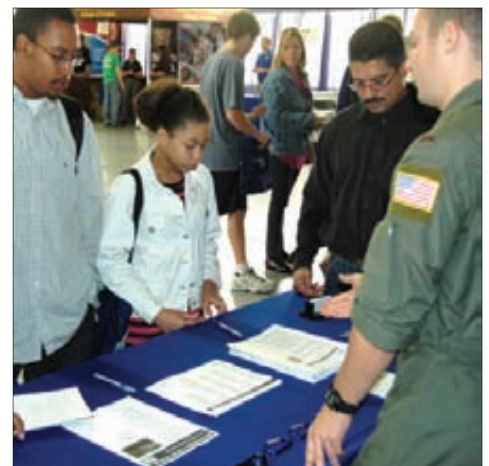
Some of the young adults attending the event meeting with representatives of the ROTC.